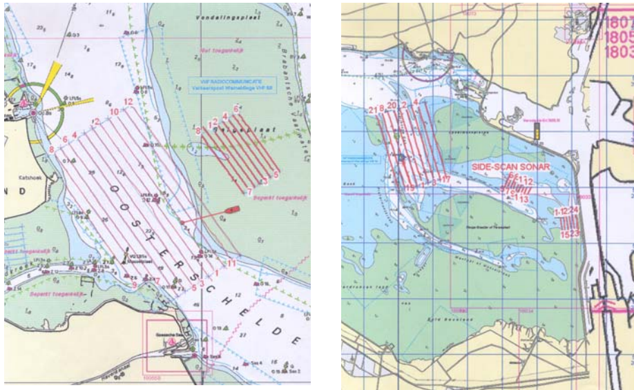
Figure 3 Sidescan sonar tracks recorded by the survey ship Schollevaar

The sidescan sonar recordings were made with two C-Max systems: the new CM2 system and the older CM800 system. The later was employed after the towfish of the first system was accidentally lost. Navigation speed during both the sidescan sonar and single beam echosounding measurements varied between 4 and 5 kts.